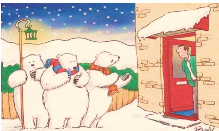
"What text would you like us to text you?"

Remember if you have something to sell, you can advertise it in the Rock Chips for $5 for three months.