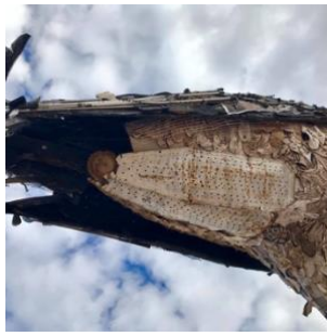
Ironing boards and boom boxes