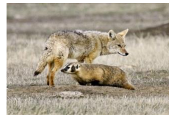
Coyote and Badger