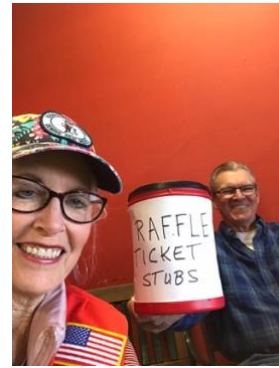
Raffle sales at Peppers