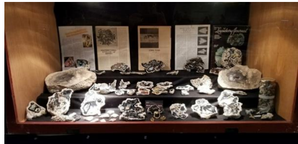
Agatized coral and lapidary articles by Bill Gallagher