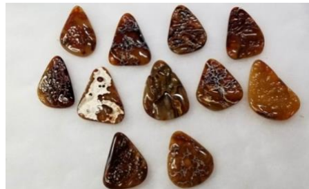
Coral pendants from Rick