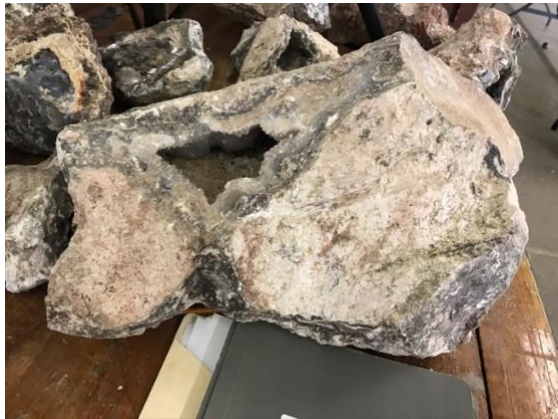
New specimens coming out of our new location at Big Diggins! Auction pieces