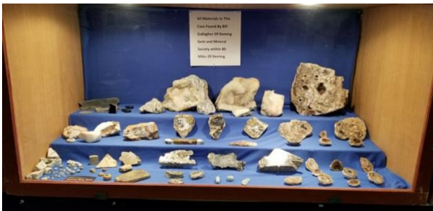
Variety of specimens collected by Bill Gallagher