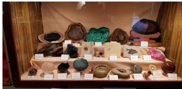
Display by Zuhl Museum, Las Cruces, NM