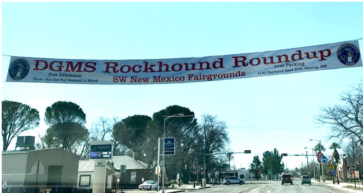
Our NEW banner!!!