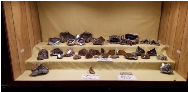
Vendor display of Thundereggs