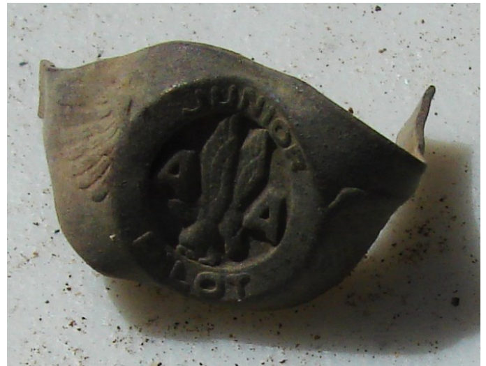
One of the Many Prizes from the Detector Contest.

FUN FIND! The ring is an American Airlines ring given to kids as a promo during the 40s.