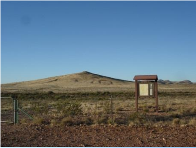
Field trip to Vista, New Mexico , May 19th,